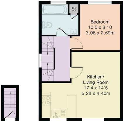
Ground Floor First Floor