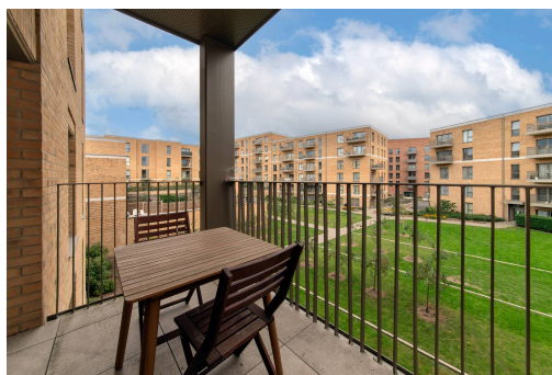
Yarrow Apartments, Bittacy Hill NW7 1TH Gross Internal Area 614 sq ft /57 sq metres