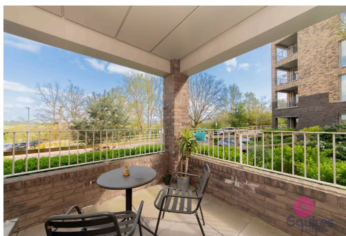
Lush House, 12 Cornforth Lane NW7 1UD Gross Internal Area 1152 sq ft / 107 sq metres