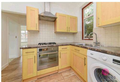
Abercorn Close NW7 1JG Gross Internal Area 409 sq ft / 38 sq metres