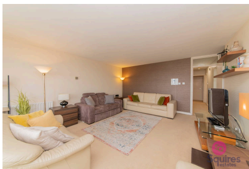
Cresta House NW3 6HT Gross Internal Area 1173 sq ft / 109 sq metres