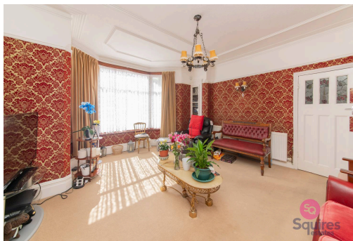
Squires Lane, N3 2QT Gross Internal Area 637 sq ft / 59 sq metres