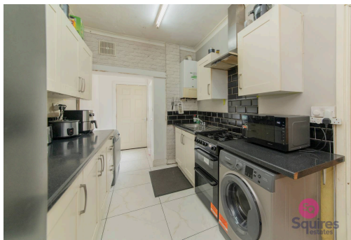
Squires Lane, N3 2QS Gross Internal Area 1292 sq ft / 120 sq metres (not including eves or garden store)